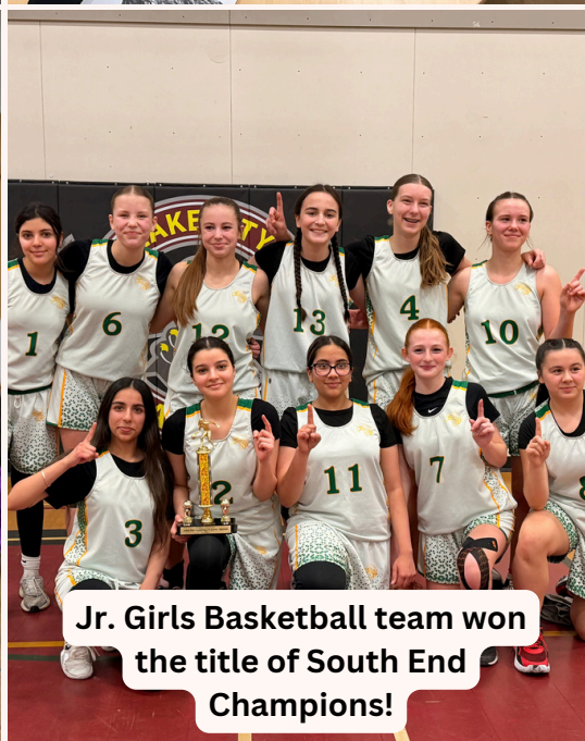
Jr. Girls Basketball team won the title of South End Champions!